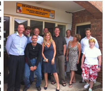
Warriors at the follow-up meeting

The follow-up meeting for the course participants was held on Wednesday 28 July at The Royal British Legion offices in Exeter. It was wonderful to see so many smiling faces and to hear from everyone.