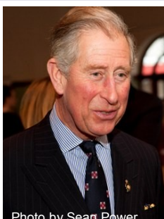
HRH The Prince of Wales

The 10th February 2010 was an historic day for The Warrior Programme as it played host to His Royal Highness, The Prince of Wales . HRH joined a discussion addressing the need to ensure more effective signposting for ex Service personnel to the services they need. During the Tea Reception HRH met with fundraisers and supporters of