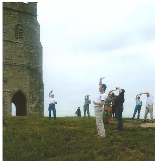
Tai Chi on Glastonbury Tor